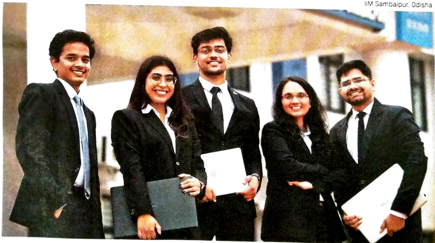
IIM Sambaipur, Odisha